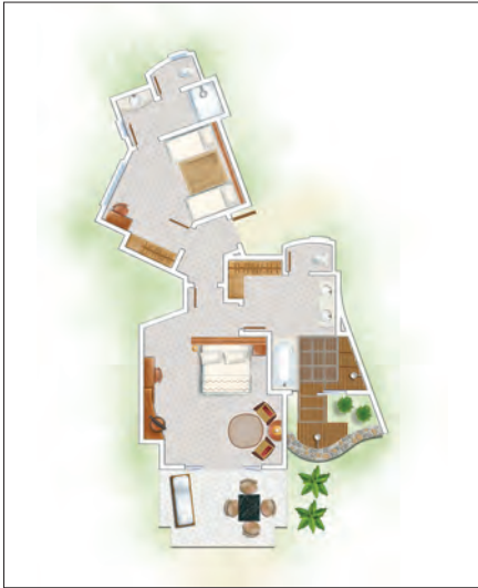
2-Bedroom Family Suite