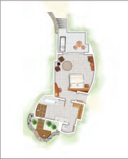
Tropical Junior Suite / Golf Tropical Junior Suite