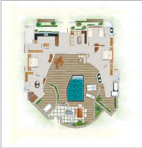
3-Bedroom Pool Villa