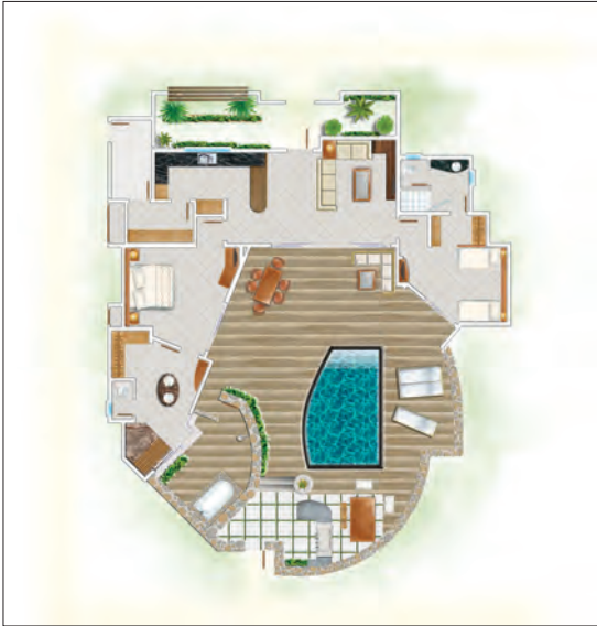
2-Bedroom Pool Villa