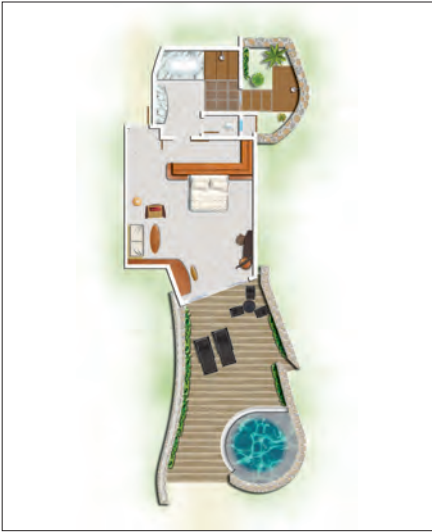
Beachfront Suite with pool