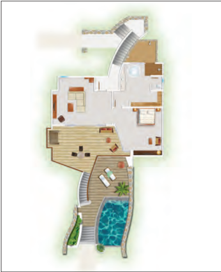
Beachfront Senior Suite with pool